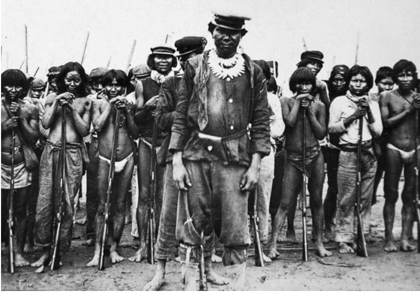
FIGURE 7. Rubber-boom-era hunters-of-hunters.

of those tree species that are fruiting at any given point in time because this is what attracts animals. 8