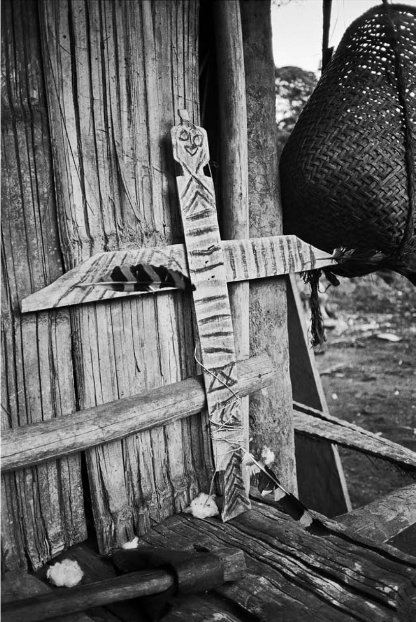
FIGURE 5. What a hawk looks like to a parakeet.