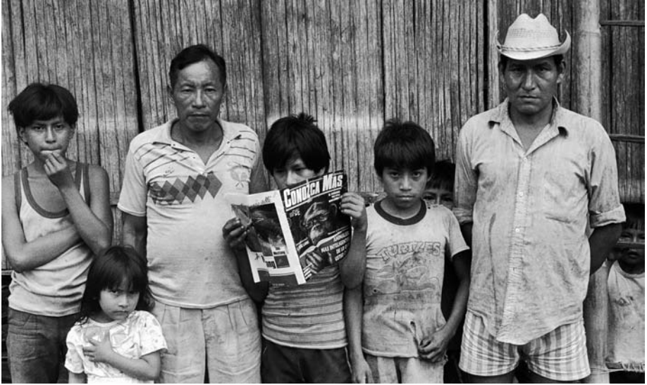
FIGURE 2. Ávila circa 1992.

Such an endeavor might seem detached from the more mundane worlds of ethnographic experience that serve as the foundations for anthropological argumentation and insight. And yet this project, and the book that attempts to do it justice, is rigorously empirical in the sense that the questions it addresses grow out of many different kinds of experiential encounters that emerged over the course of a long immersion in the field. As I've attempted to cultivate these questions I've come to see them as articulations of general problems that become amplified, and thus made visible, through my struggles to pay ethnographic attention to how people in Ávila relate to different kinds of beings.