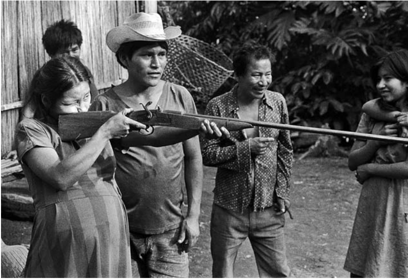
FIGURE 4. A muzzle-loading shotgun ( illapa).