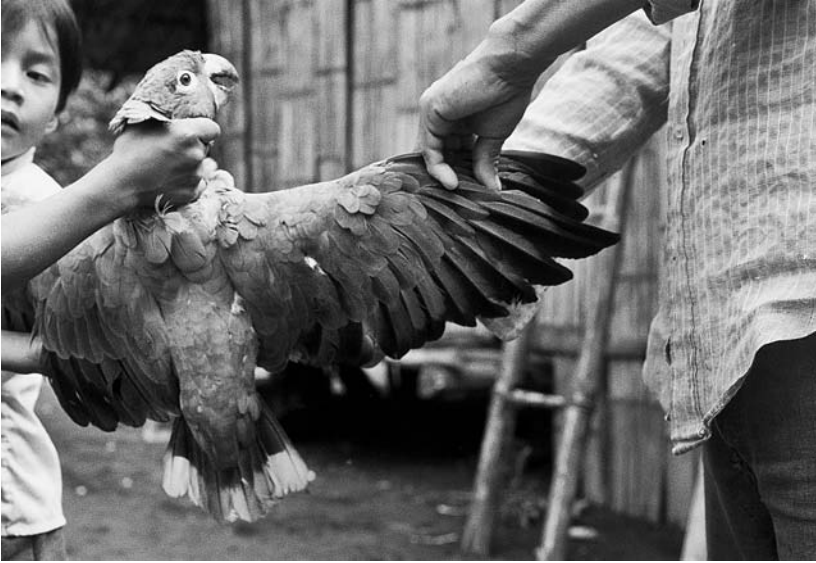
FIGURE 6. When dead animals are brought home from the hunt they are fondled with curiosity by children and studiously ignored by adults.

unremarkable. The feeling of disjunction that this lack of recognition creates is also part of the difficulty of reality. Hunting, in this vast ecology of selves, in which one must stand as a self in relation to so many other kinds of selves who one then tries to kill, brings such difficulties to the fore; the entire cosmos comes to reverberate with the contradictions intrinsic to life (figure 6).